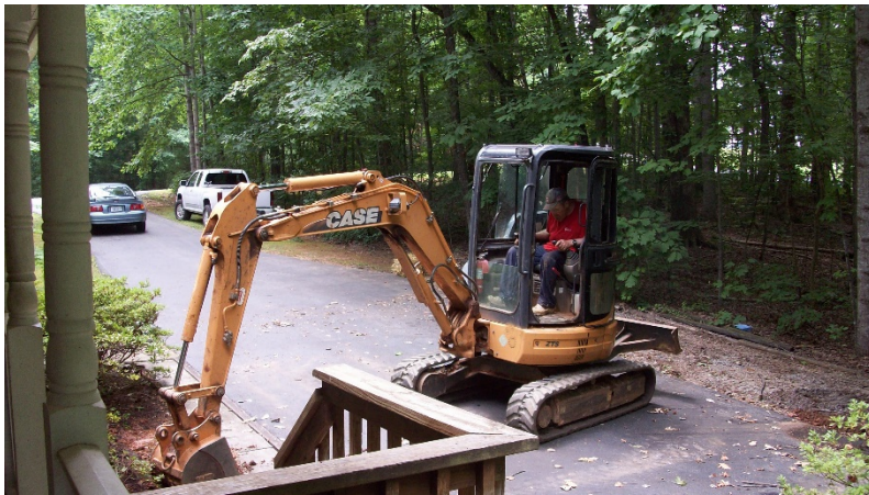
Getting ready to dig the hole to replace the mailbox ... LOL (BIG mailbox)

First off, some of you will be getting those "friendly reminders" from me in the next couple of months, so surprise me and renew with STARFLEET if you can. I've had a couple of easy months and March and April will be busy (check NL). WHEN you renew, please send me a quick email letting me know.